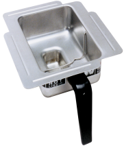
FUNNEL ASSY, SST-PP BLK HNDL