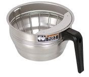
FUNNEL ASSY,SST-BLK HDL(7.62)