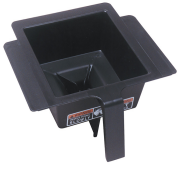
FUNNEL W/DECAL,PPK NAR BLK(SM)