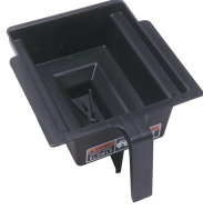
FUNNEL W/DECAL,PPK NAR BLK(LG)