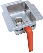
FUNNEL ASSY,SST-PP ORANGE HDL