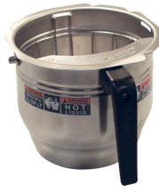
FUNNEL AY,W/DECAL GRT "C"7.12