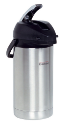
AIRPOT, 3.8L SST LA SINGLE PK