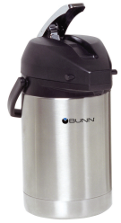
AIRPOT, 2.5L SST LA SINGLE PK