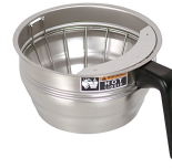
FUNNEL ASSY, SST-BLK HDL(7.12)