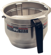
FUNNEL AY,W/DECAL GRT "C"7.62