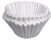
FILTERS,C GOURMET 500/2 50/CL