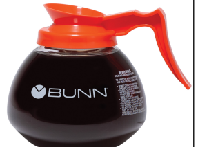
DECANTER, GLASS- ORN 12 CUP 1PK